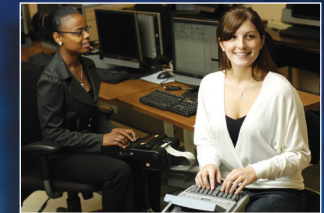
Pictured: Orleans Graduates