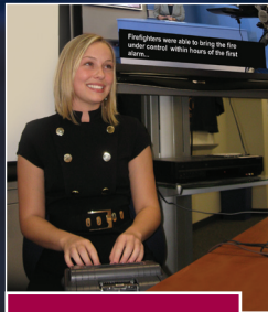
TV Broadcast & Video Captioning