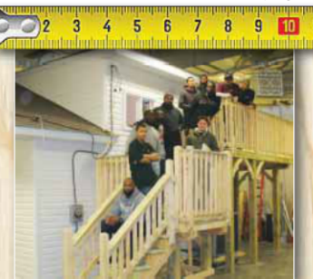
House & deck built by Orleans Carpentry graduates.

With a history of success for nearly 40 years and newer training facility